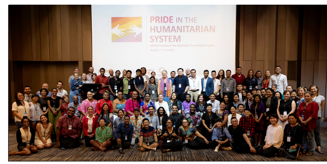
The participants of Pride In The Humanitarian System held in Bangkok, 2018

Understanding the needs of SOGIESC people is critical to address the inequalities we experience during preparedness, response and recovery. All actors of the humanitarian system must be mutually committed, responsible, and accountable to including SOGIESC policies. It is only when we work together that we will achieve a just and equal response to humanitarian crises.