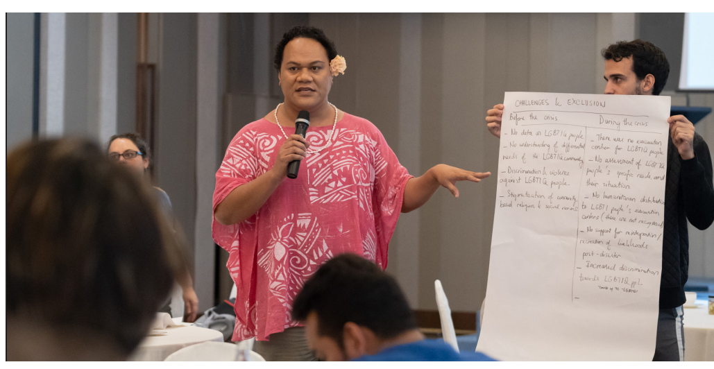
The participant of Pride In The Humanitarian System held in Bangkok, 2018